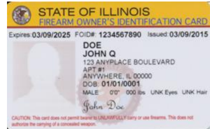
Front of New FOID Card 3/15